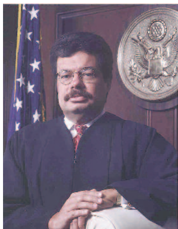
The Honorable Ivan Lamelle.

was quite able to command full confidence and the respect of many faraway groups. Meanwhile, they assured the world around us of A.A.'s worth. These are